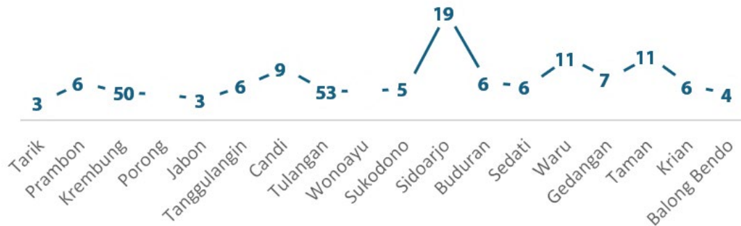
Figure 1. Number of SME in Sidoarjo Year 2024

population, market access, and infrastructure in each sub-district. Sidoarjo SMEs face several significant challenges that hinder the development of their innovative capabilities. Limited access to capital, cutting-edge technology, and managerial skills are key barriers that limit the capacity of SMEs to implement sustainable innovation and maintain long-term competitiveness (Muawanah & Pujiyanto, 2024). This condition raises concerns about the sustainability of the SME sector in Sidoarjo Regency, which is facing increasingly complex market dynamics.